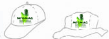
Hats for Souvenirs or Staff