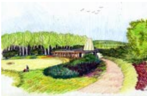
Walk to Visitor Centre