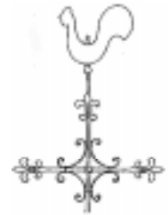
Detail of a Cross & Weather Cock

The idea of bringing Canadian history to life by interpreting its historic buildings and streetscapes figures prominently in the approach taken in the Canadian Museum of Civilization's Canada Hall. Offering a cultural message in an entertaining fashion was a challenging and innovative undertaking for Commonwealth, who worked closely with the museum's planners over a three-year period. Our services included historical research, detailed design of buildings and environments, and construction management for the structures.