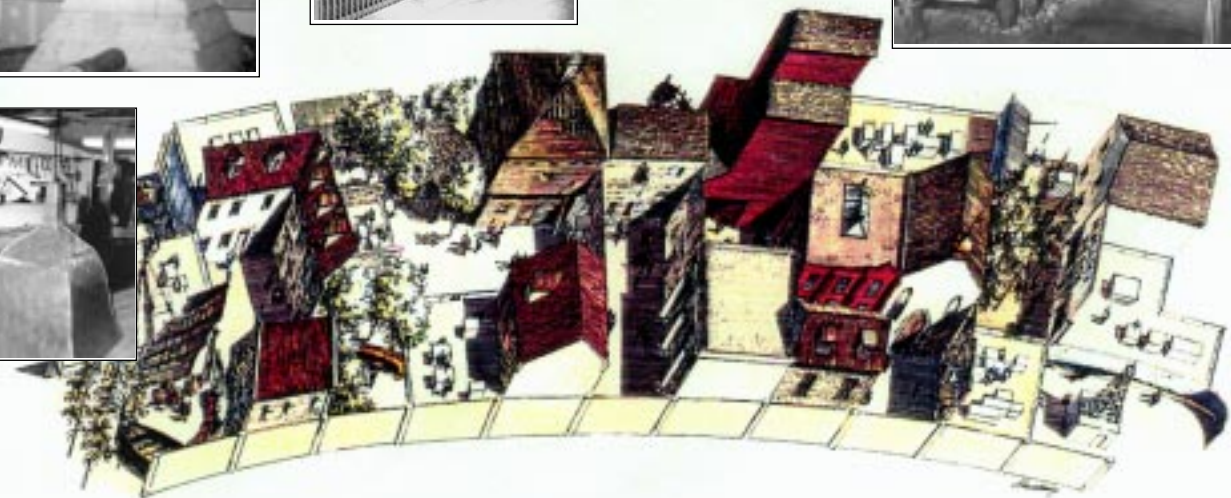
Conceptual illustration of Canada Hall, Canadian Museum of Civilization