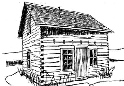
THE FAYANT HOUSE 1960